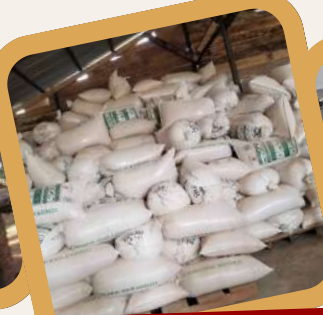
Modern hermetic grain storage bags