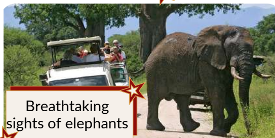
Breathtaking sights of elephants