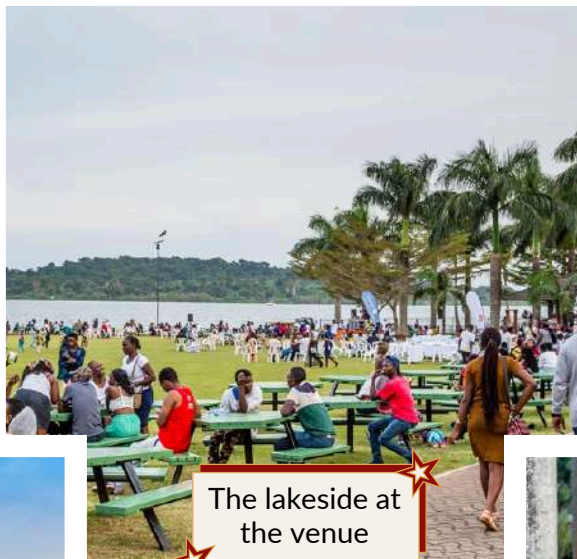
The lakeside at the venue