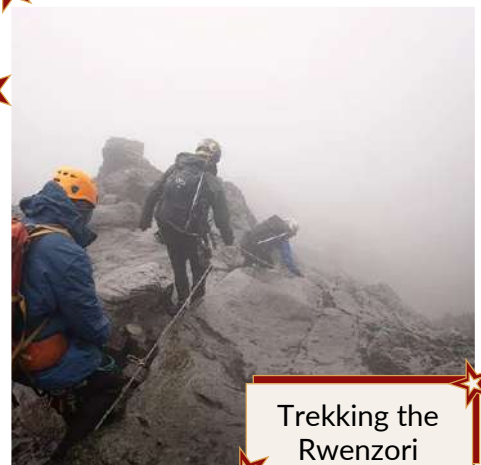
Trekking the Rwendori