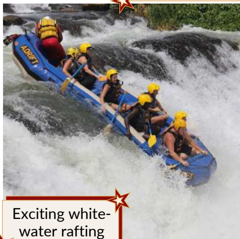
Exciting white- water rafting