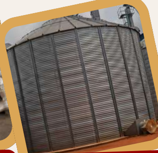
Modern grain storage structure

WE ARE ACCEPTING ABSTRACTS IN THE FOLLOWING SCIENTIFIC PROGRAM THEMES. DEADLINE FOR ABSTRACT SUBMISSIONS (BOTH ORAL AND POSTER) IS MARCH 1, 2026, AND THE DEADLINE FOR PAPER SUBMISSIONS IS MAY 1, 2026