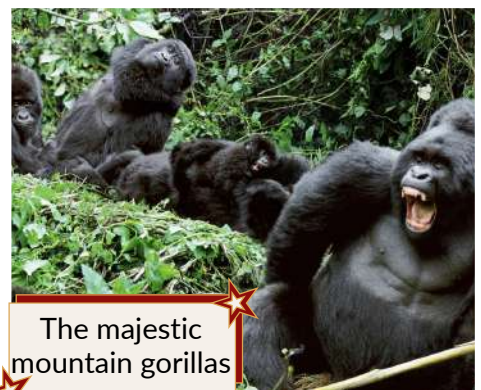
The majestic mountain gorillas