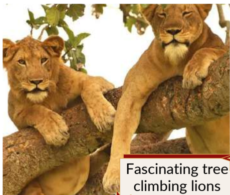
Fascinating tree climbing lions