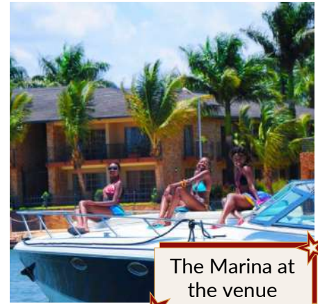
The Marina at the venue