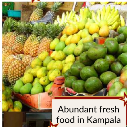
Abundant fresh food in Kampala