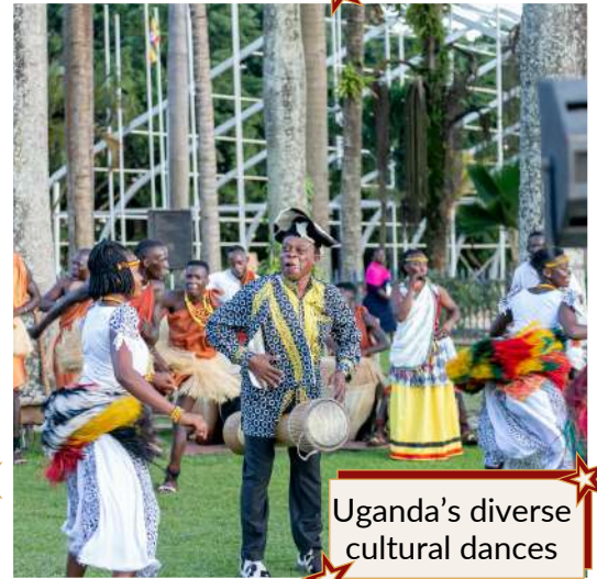
Uganda's diverse cultural dances