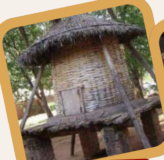
Traditional African storage structure