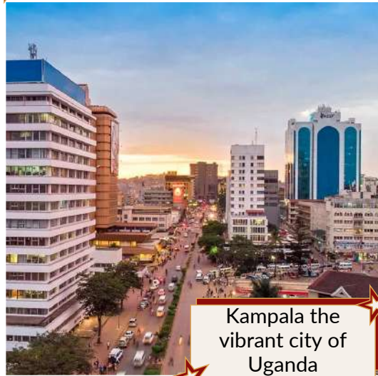
Kampala the vibrant city of Uganda