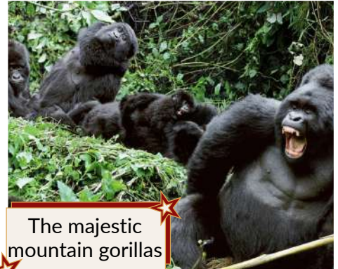
The majestic mountain gorillas