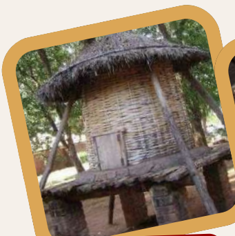
Traditional African storage structure