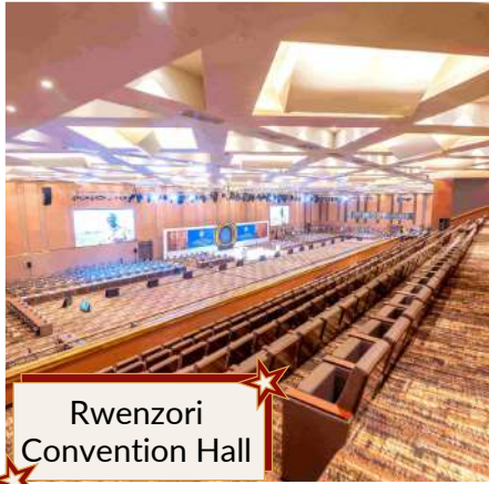
Rwenzori Convention Hall