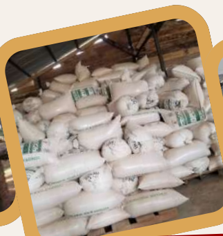
Modern hermetic grain storage bags