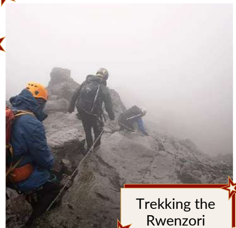
Trekking the Rwenzori